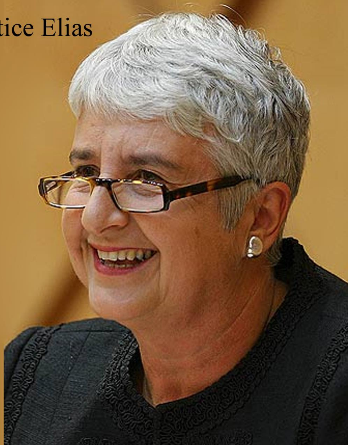
The Rt Hon Chief Justice Elias (New Zealand)