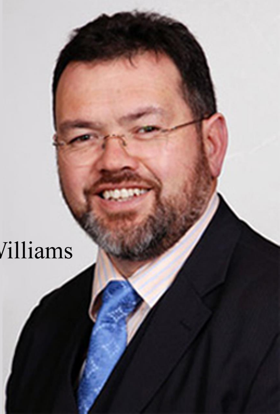
The Hon Justice Joseph Williams (New Zealand)