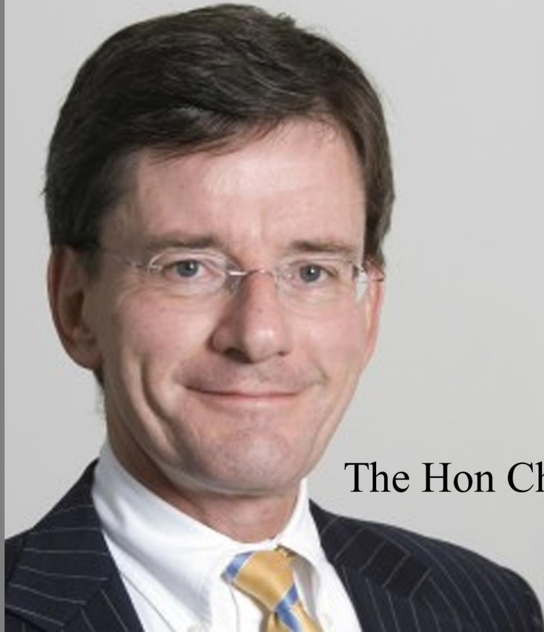
The Hon Christopher Finlayson QC Attorney-General (New Zealand)