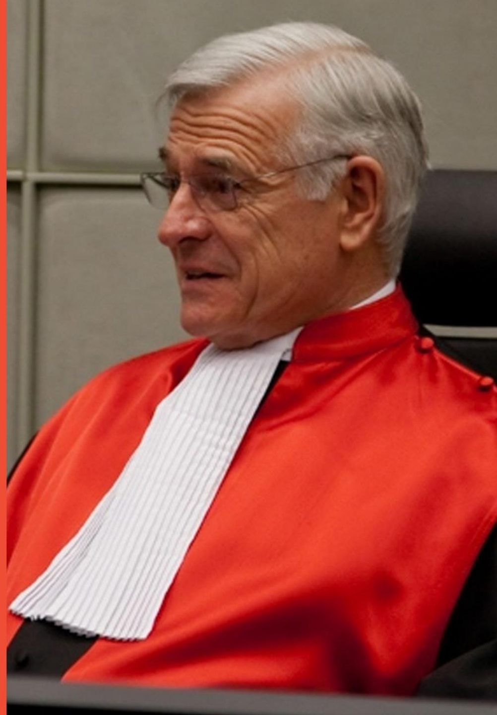
Sir David Baragwanath (New Zealand)