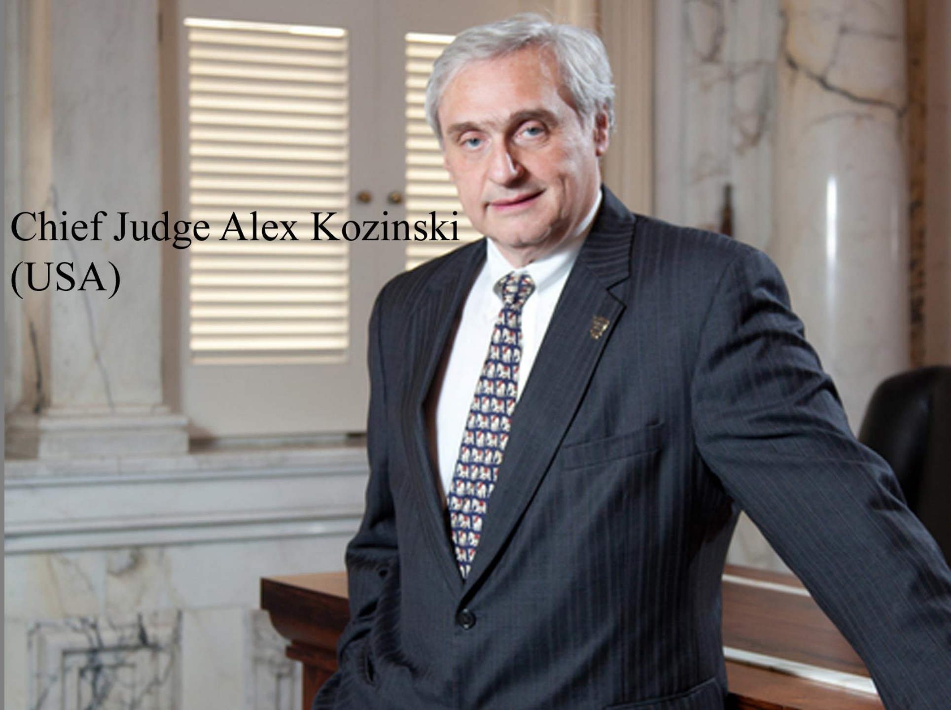
Chief Judge Alex Kozinski (USA)