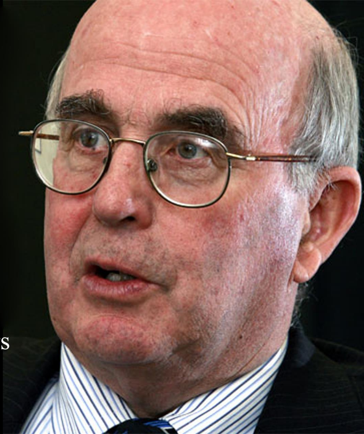
Sir David Carruthers (New Zealand)