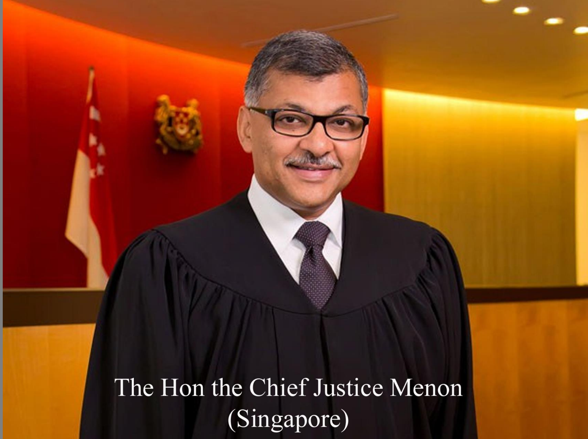
The Hon the Chief Justice Menon (Singapore)