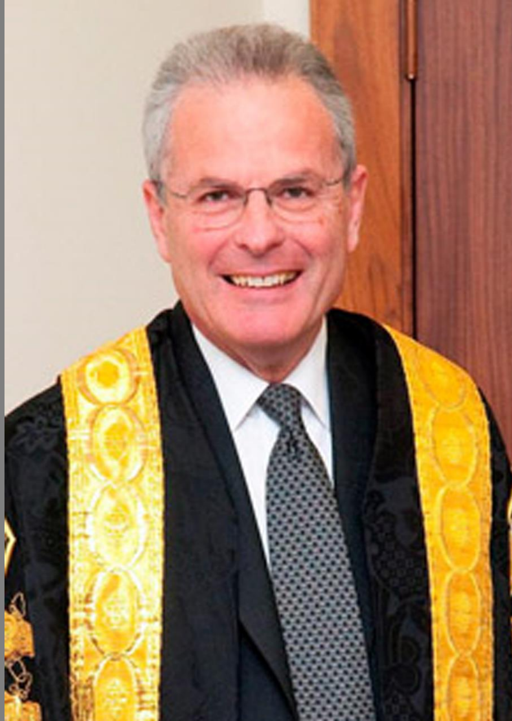
The Rt Hon Lord Dyson Master of the Rolls (United Kingdom)