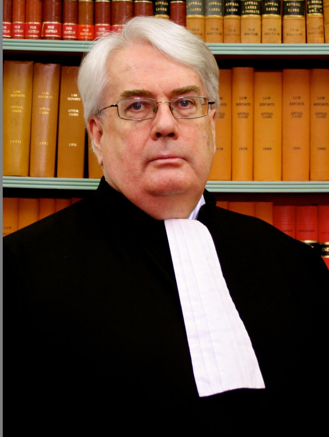
The Hon. Mr. Justice Frank Clarke (Ireland)