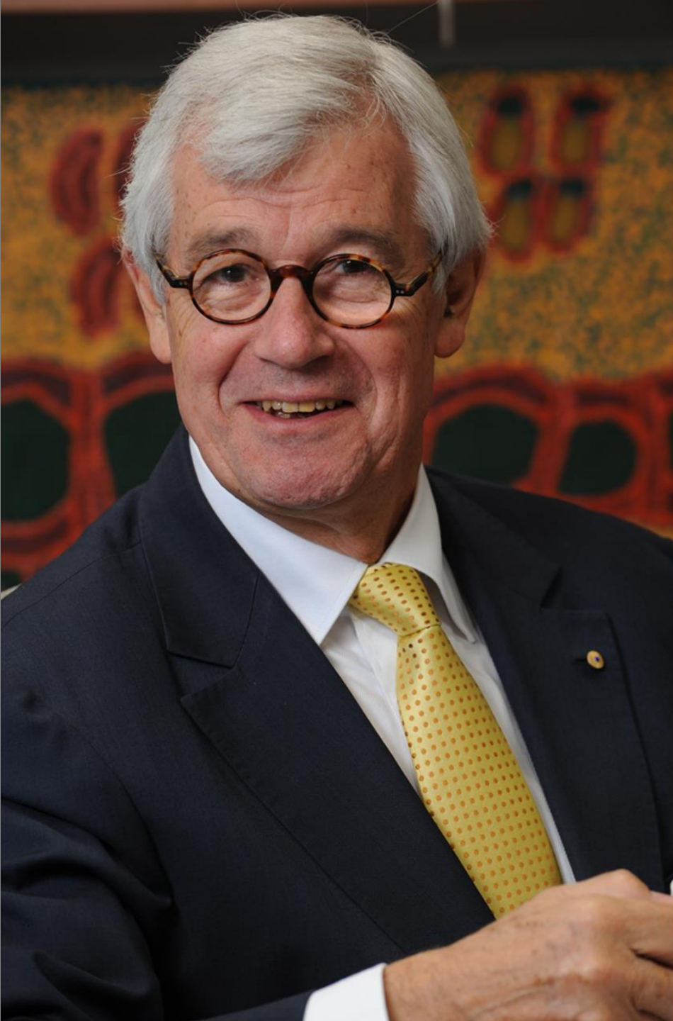
Julian Burnside AO QC (Australia)