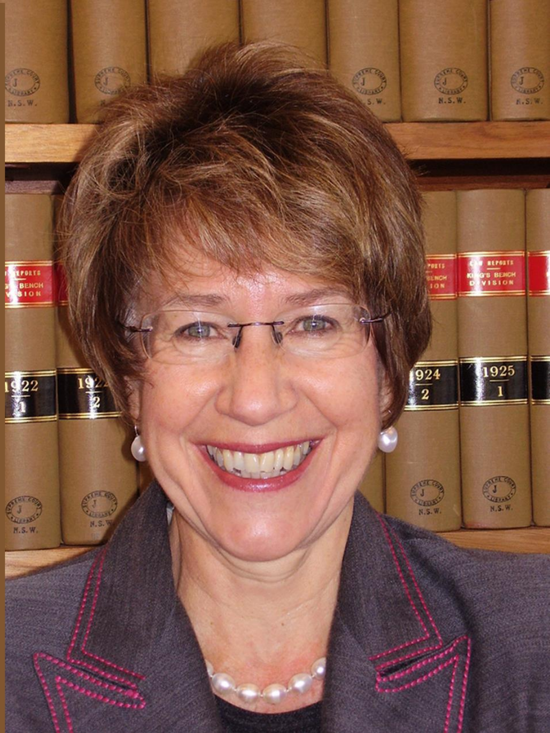
The Honourable Justice Margaret Beazley AO (Australia)