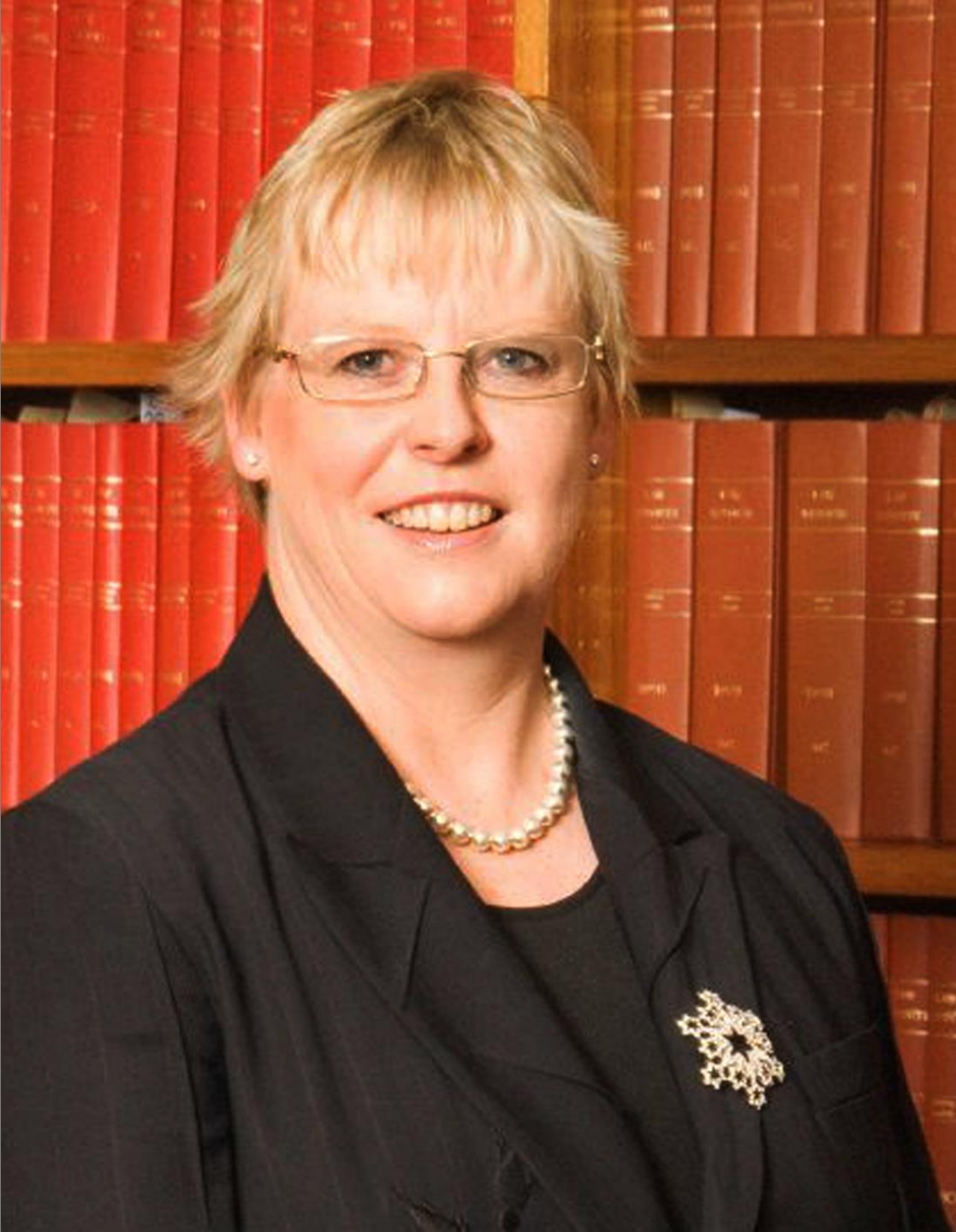
Hon Justice Julie Ward (Australia)